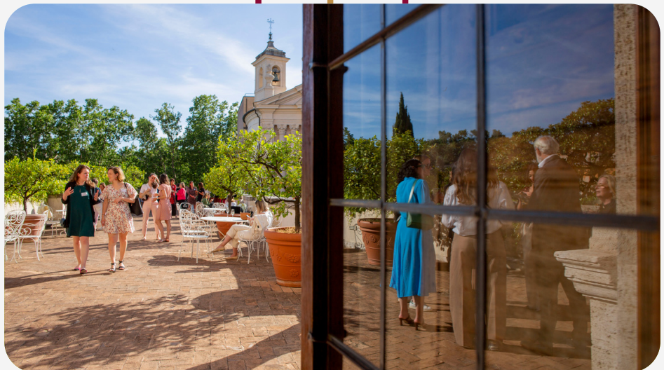
Closing Networking Cocktail